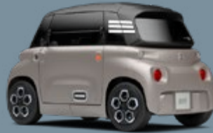
MY AMI BLUE