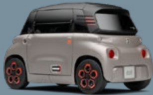
MY AMI ORANGE