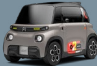
MY AMI PEPS

For even greater customization, AMI PEPS is available. This pack includes kit components and specific equipment such as rear light trims, bumper reinforcements, etc. They are fitted by professionals before delivery.