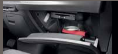
CD player in the glove box

To personalise yours further, Citroën Grand C4 SpaceTourer offers a number of practical accessories.