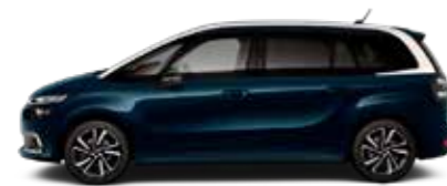
ALCHEMY BLUE (PM)