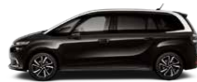
PERLA NERA BLACK (F)