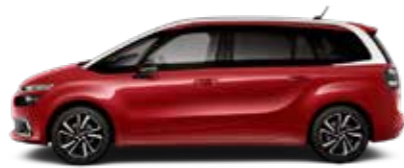
RUBY RED (PM)