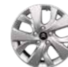
16" 'VIPER' ALLOY WHEELS