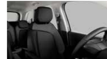
SLATE GREY BLACK 'MILAZZO' CLOTH UPHOLSTERY