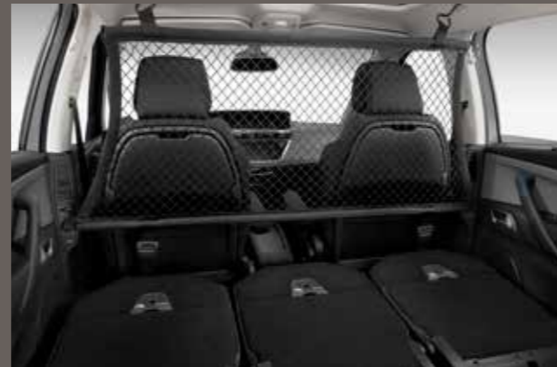
High load net