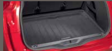
Thermoformed boot tray