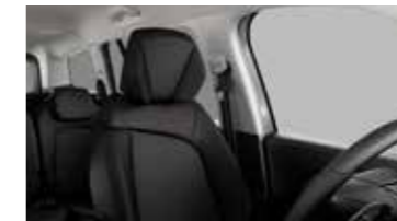
BLACK LEATHER EFFECT GREY 'FINN' FABRIC UPHOLSTERY