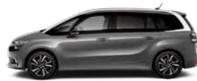
PLATINUM GREY (M)