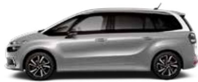
CUMULUS GREY (M)