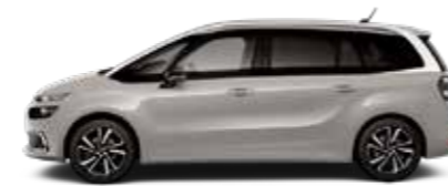
PEARL SAND (PM)