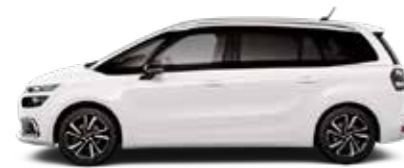
POLAR WHITE (F)