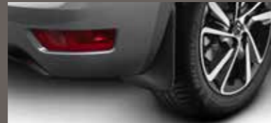
Rear mud flaps