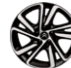
17" 'BLACK ZEBRA' DIAMOND-CUT ALLOY WHEELS

(PM) : Premium metallic - (M) : Metallic - (F) : Flat.