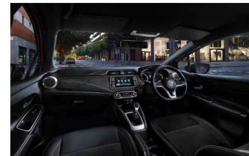
Part Alcantara/Synthetic Leather Seats