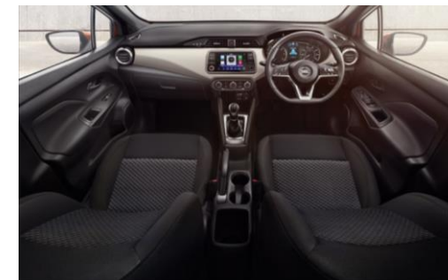
Black Cloth Seat Trim