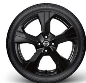
17" Enigma Black Alloy Wheels