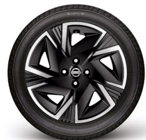
16" Flex Two Tone Wheel