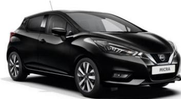
METALLIC - €550