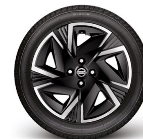
16" Flex Two Tone Wheel