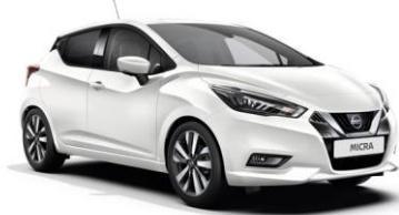
PEARL - €550