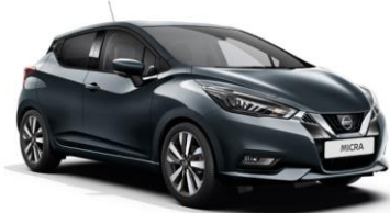
METALLIC - €550