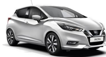
METALLIC - €550