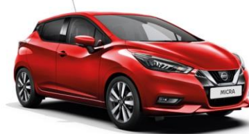
PEARL - €550