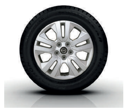
17" Alloy Wheel Optional