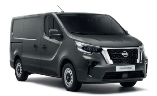
Comete Grey - M GCM