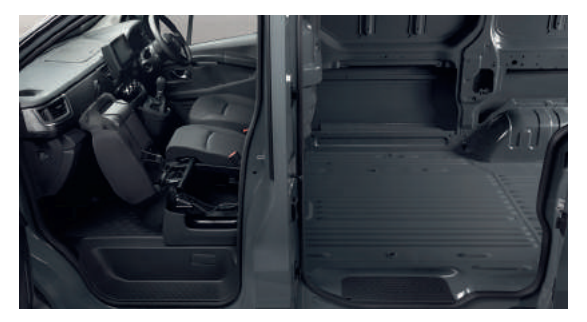
A 1.0m wide sliding door is available for one or both sides.