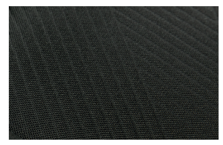
Black Java Upper Trim Optional