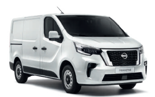
White Glacier - S WHI