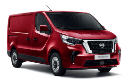
Red Carmin - M RCM