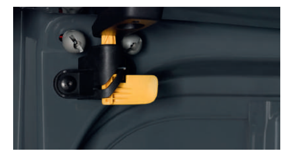
This clever device lets you lock a rear door open