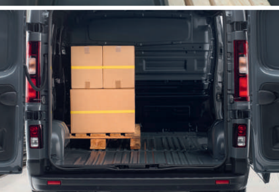
90° /180° /255° for unimpeded, 1.3M wide access