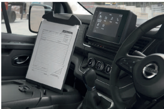
Mobile Office functionality*