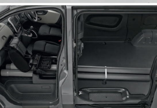
Sliding side door is over a metre wide, Side-hinged rear doors open to easily take a Europallet.