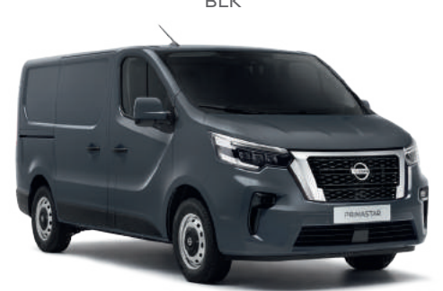
Urban Grey - S GRU