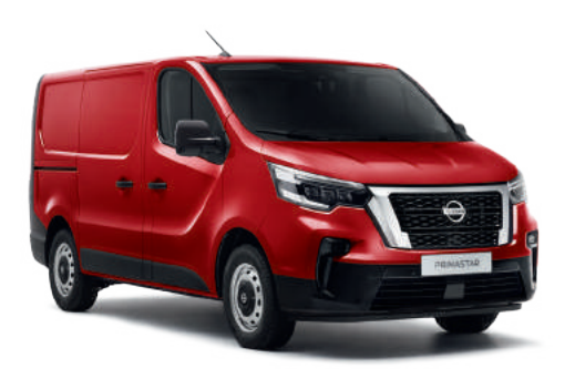
Red Magma - S RMB/R70