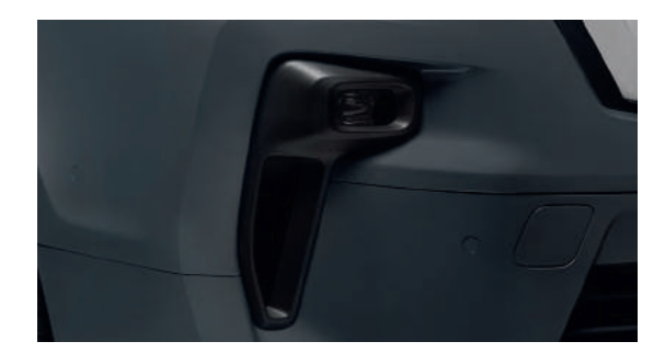
Side vents with LED fog lamps