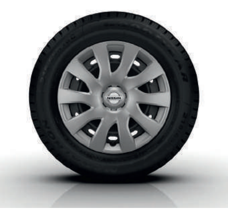
16" Wheel Cover Optional