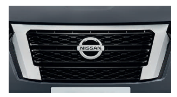
Distinctive Interlock-grille design