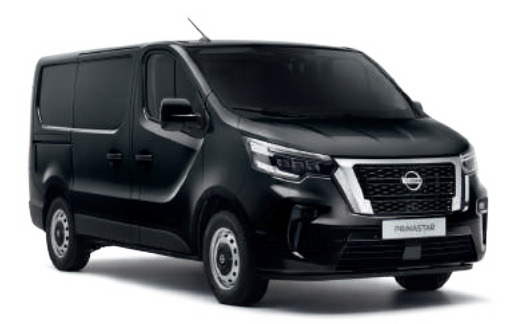
Black Midnight - M BLK