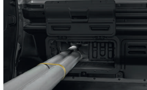
Bulkhead flap lifts to allow extra long objects – up to 3.75M in the L1 Primastar or 4.15M in the L2 Primastar.*

With sliding doors available on both sides, wide-opening rear doors and up to 18 anchor rings in the back, new Nissan Primastar makes loading effortless and securing your cargo simple, whatever shape or size it is.