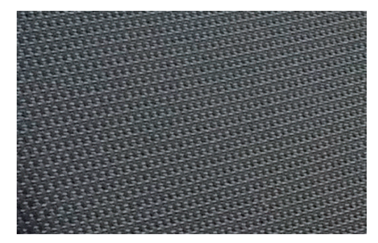
Basic Trim Standard