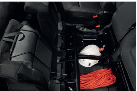
54 litres of storage beneath the passenger seats*