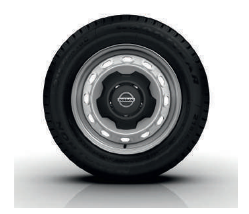
16" Steel wheel As Standard