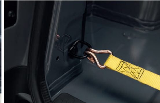
Up to 18 built-in side and floor mounted tie-downs to keep your load secure.