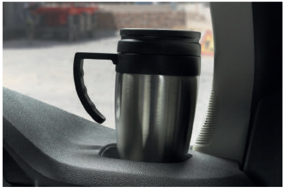
Convenient cup holder to safely hold your beverage*