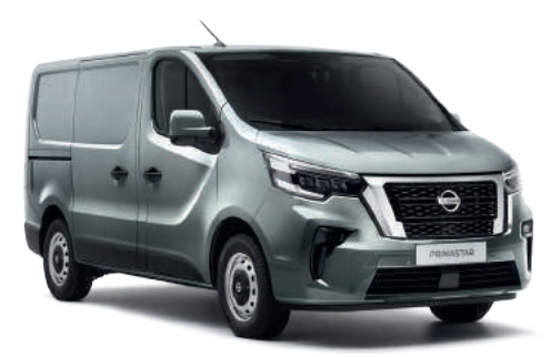
Highland Grey - M GHG